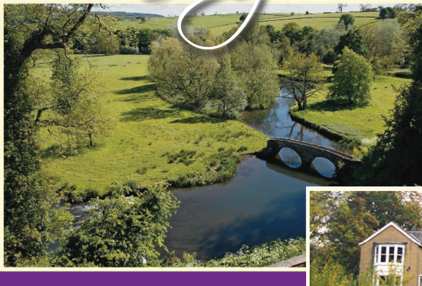
Above: Derbyshire countryside At left: Unstone Grange - unstonegrange.co.uk